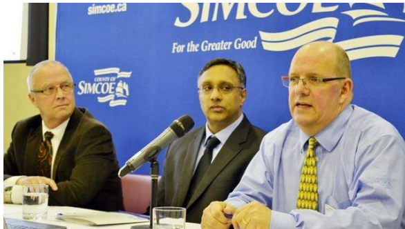
Siting Public Consultation Session – fall 2015

With submission of land use planning applications in November 2016, the engagement process was necessarily temporarily suspended to allow the formal, legislated process to begin as outlined in the Planning Act . It is the understanding of the Project Team that this should continue until the outstanding land use planning matters are settled. Following that, meaningful engagement with the public, near neighbours, Indigenous communities, and stakeholders will resume with further direction from County Council.