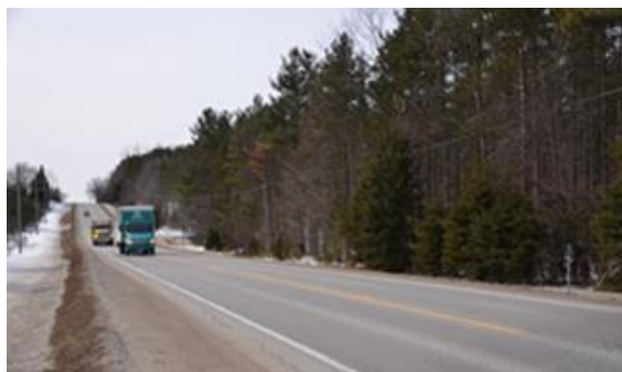
2976 Horseshoe Valley Road West, Springwater (facing west)

Following a rigorous siting process (details provided further in this item), it was determined that both facilities and County waste operations would benefit from co-locating both the OPF and MMF on a single, centrally-located site – 2976 Horseshoe Valley Road West, Springwater. The complex is referred to as the Environmental Resource Recovery Centre – highlighting our continued commitment to work diligently and innovatively to recover divertible materials, such as organics, from our garbage and, in essence, to view our waste as an opportunity beyond the landfill.