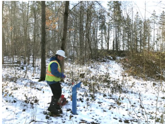
On-going groundwater monitoring on the ERRC footprint

Of note, in addition to the Compensation Planting Plan , work related to fire protection planning was initiated last fall. It is anticipated that having further detail on these matters will assist in addressing near neighbours’ primary concerns and initiate “next steps” in our collaboration with the Township of Springwater (specifically working with their Fire & Emergency Services staff). In regard to fire protection, the County has retained the services of RJ Bartlett Engineering Ltd. – a specialized fire protection engineering firm. This team will work alongside GHD on various aspects of fire protection – from design considerations to a fire safety plan related to future operations at the ERRC complex.