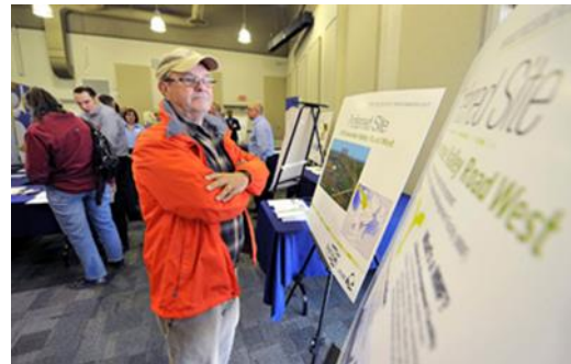
Public Information Session – April 2016