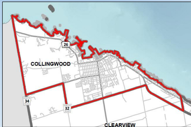
Figure 1: Town of Collingwood.

Sources: Statistics Canada and building permit data from the municipality.