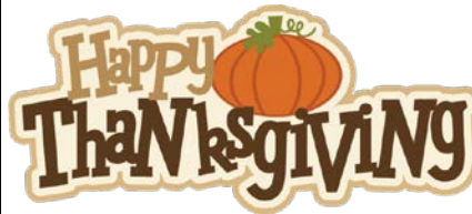
Columbus Day (US) Thanksgiving Day (Canada)

1:00 Group Exercise 2:00 Resident Birthday Cart (unit to unit)