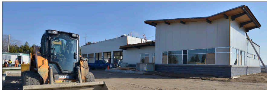
Alliston station development.