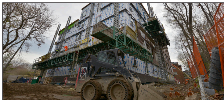
Brooks Street redevelopment.